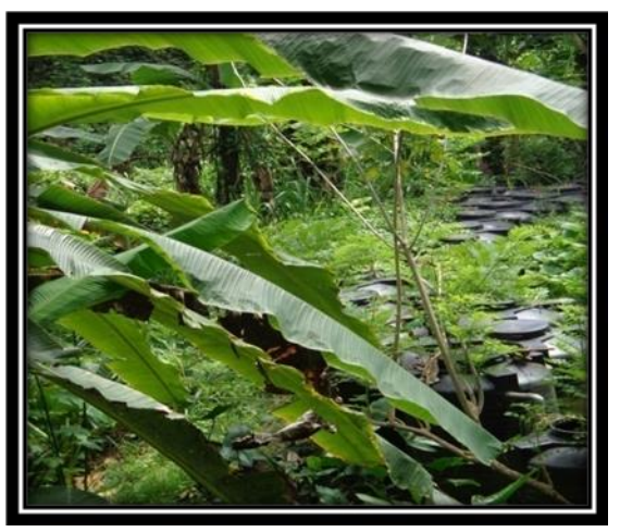
Photographs 9 and 10 – Sewage Waste Recycling Unit Constructed at a cost of Rs.2,355,000 but abandoned.

2:4 It was observed that the period of compost fertilizer production exceeds the normal period of 1 ½ months due to the excess water content of the Waste.