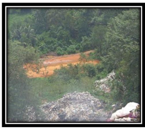
Photograph 4 Landslide of the Garbage Heap

This garbage heap was subjected to a land slide in the past causing the evacuation of 23 families living in the adjoining lands and relocating them in alternate lands in the Goluwawila area. It was observed that the approach road to the Municipal Council Village had been totally covered. Even though the Chief Minister of the Sabaragamuwa Provincial Council had caused the preparation of an estimate of Rs.2,522,889 under the improvements to the final garbage disposal yard at Kanadola, for reconstruction of the road and as a remedy for any repetition of the landslide of the garbage dump the work had not been completed so far. The existing status in clearly depicted in photographs 4,5 and 6.