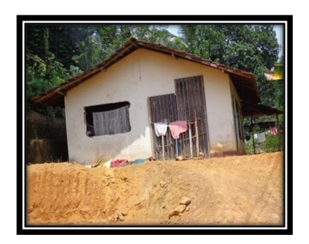
Photograph 6 House of an evacuated Family

2:3 The Centre constructed at a cost of Rs.2,355,000 for the Disposal of Garbage and Sewage had been idling and Sewage Waste had been released to the open environment.