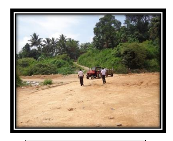
Photograph 19 Unauthorized Occupants