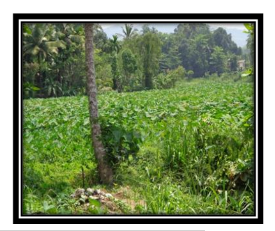
Photograph 17 and 18 – Fallowed Paddy Lands