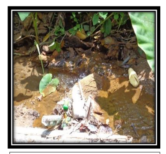
Photograph 16 Contaminated water flowing from Surface Recycling system into Water Sources