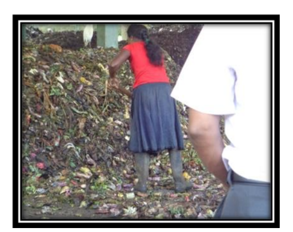
Photograph 11 and 12 – Compost Production Yard at Outer Circular Road

Land for the commencement of a Compost Production Project at the Kanadola site had been prepared by the date of audit inspection on 27 March 2013. The United Nations Economic and Social Commission for Asia and Pacific (UNESCAP) and the Sevanatha Institute had agreed to provide the sum of Rs.45,131,000 required for the purpose and plans had been made for the relocation of the Compost Production Unit at Outer Circular Road to this place after the construction. There was no evidence that the progress had been reported. This is clearly depicted in photographs 13 and 14.