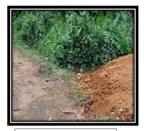
Photograph 15 Contaminated Springs at the bottom of the Garbage Heap

A large number of springs were observed at the bottom of the hill on which waste is dumped. The local residents informed that the water from the springs is unfit for drinking and they are compelled to travel about 01 kilometre to obtain drinking water. There was no evidence that the garbage dumped over long periods on the ground surface would not turn anaerobic and would not release highly poisonous lichem as well as hydrogen sulphide, sulphur dioxide and methane due to garbage dumped on ground surface turning anaerobic. Various experiments have revealed that the lichem generated in places with anaerobic garbage is about one thousand times deadlier than the poisons present in the waste in normal latrines. The bacteria active in this liquid use the oxygen in the water and air heavily for their activities and if such liquid mixes into the water courses the liquid oxygen in the water will be absorbed by the bacteria and results in the extinction of aquatic organisms and aquatic plants. If the bacteria enters the human body bacteria will remain active for long periods and could become incurable These matters were explained in the letter No. 31324 dated 18 April 2011 of the Municipal Engineer addressed to the Municipal Commissioner. It was observed that the spring water contaminated in the manner explained above flows into the Mudduwa Canal which flows into the Kaluganga. This position is clearly depicted in photographs 15 and 16.